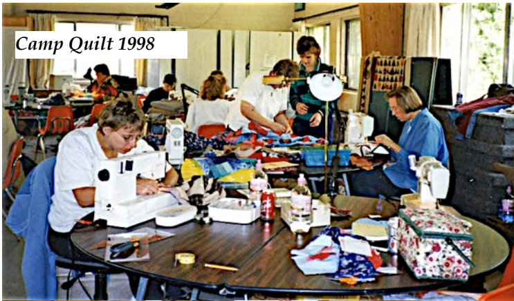
Camp Quilt 1998